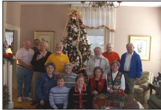
Ole Smoky Sam members at the Ronald McDonald House in Knoxville, Tennessee

Our Christmas Dinner was held at the Sagebrush in Oak Ridge. The food was great but the service was terrible. Unfortunately, the restaurant was short-handed that night and our "only" waitress was clearly stressed. A positive way to think about it is to remember that we had plenty of time to visit and no one was talking with their mouth full. December is also the time for our annual Christmas visit to the Ronald McDonald House. This time we had 12 members present for the presentation of cans, tabs and gift cards.