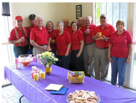
Enjoying punch and cookies.