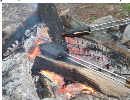
Pie irons work their magic!