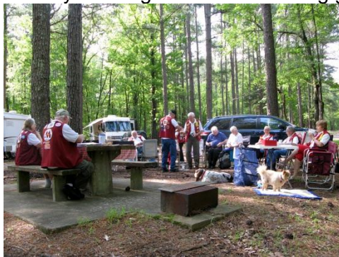
Saturday's "Meeting" in the great outdoors.