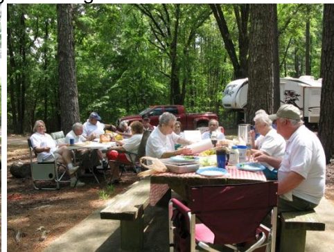
Sharing a "brown bag" lunch.