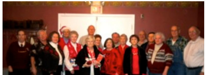
Music City Sams Christmas Luncheon December 2011