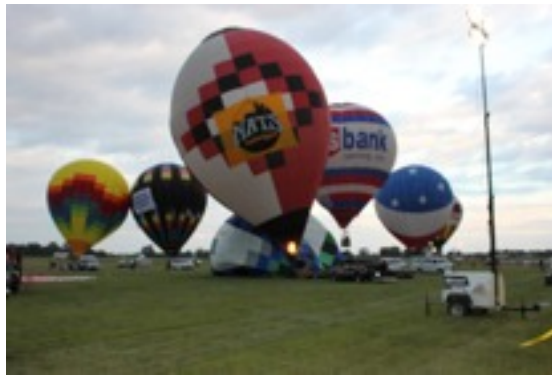
Balloon Festival Sept