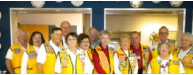
Serving Christmas lunch for the Mid-Tennessee Council of the Blind